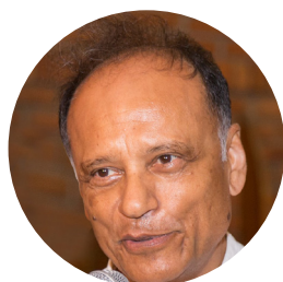
Sir Partha Dasgupta Frank Ramsey Professor Emeritus of Economics, University of Cambridge, UK