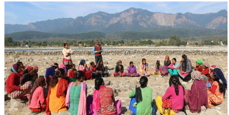
The Emerging Role of Youth in the Transboundary Water Governance in South Asia