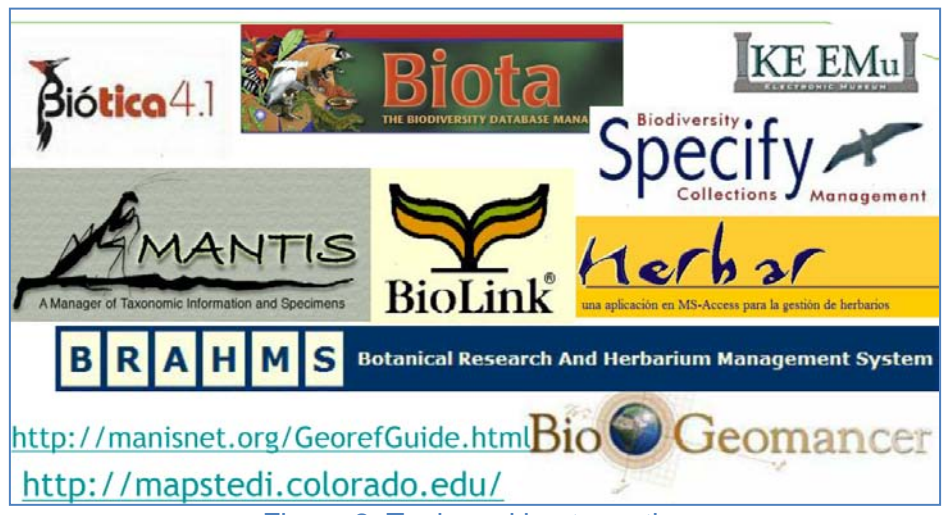
Figure 2: Tools and best practices

He urged to initiate a digitisation project and develop an action plan before running any digitisation projects. Assessing and enhancing fitness-for-use data is critical for scientific and social relevance of biodiversity science. The data quality assessment and quality control are two important components of fitness-for-use regime. It is significantly important for an organization to have a vision with respect to having good quality data, policy to implement that vision and a strategy for its implementation. He further discussed issues influencing and responsible players for data quality; and a framework for data cleaning. He ended his presentation by talking about the principles of best practices like accuracy, effectiveness, efficiency, reliability, accessibility, transparency, timeliness and relevance. The GBIF Training Manual 1: 'Digitisation of natural history collections data' is available at <a href="http://www2.gbif.org/TM1.pdf">http://www2.gbif.org/TM1.pdf</a>