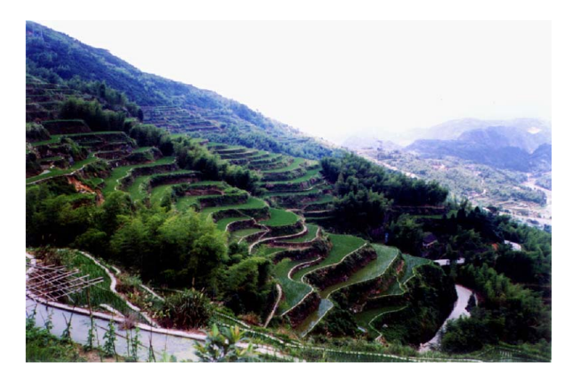
Fig. 1. Terraced rice-fish landscape in Zhejiang province, China.

province, such as Qingtian County. It is commonly called 'field fish' or 'paddy rice fragrance'. It is so-called because it is usually found along the Oujiang river, Zhejiang province of China. The survival of this indigenous species testifies to the biodiversity conservation function of rice– fish systems. Heyuan carp is the first generation of the hybrid that is mothered by Hebao red carp of Wuyuan County, Jiangxi province, and fathered by wild carp of Yuanjinang County, Yunnan province. It demonstrates both the indigenous color and diversified heredity. It has a fast growth speed, with weight reaching 500 g in the first year. A total of 70% of its weight is made up of flesh, hence the name 'fleshy carp'. It is widely distributed in the rice–fish farming systems in the middle and lower reaches of the Yangzi river basin, China.