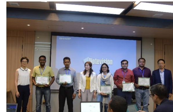
Earth Observation Data processing