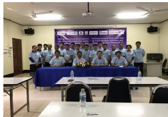
Urban, Agri. And DM In Mekong Basin