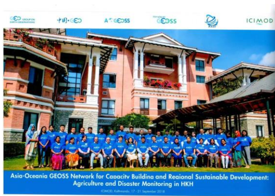
Agriculture and Disaster Monitoring in HKH