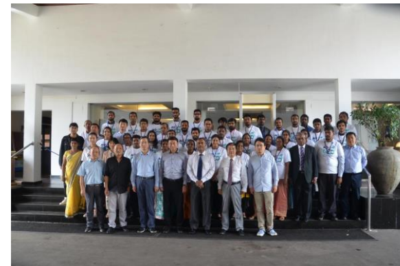
Agricultural, Marine and Ecological Environment