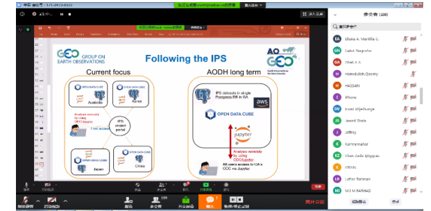
17 On-site trainees from 12 countries, including Nepal, Pakistan and other Asia, Africa, South America countries. 252 Online trainees from 24 countries.