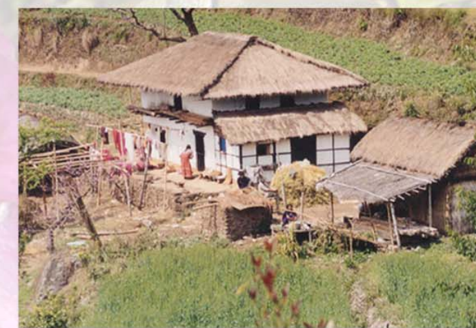
5 A socioeconomic study Participatory action research