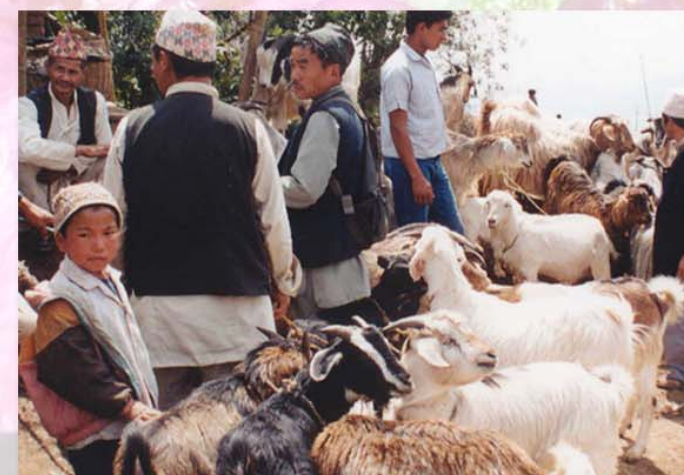
6 Enhancing livelihoods through livestock An implementation strategy and follow-up action