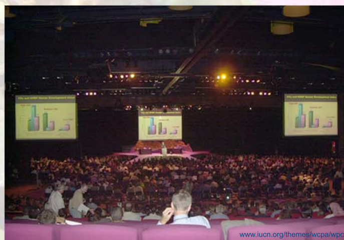
8 World Park Congress in Durban Establishing global linkages