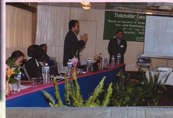
4 National corridor strategic action plans drafted National and regional consultations in Bhutan, India, and Nepal