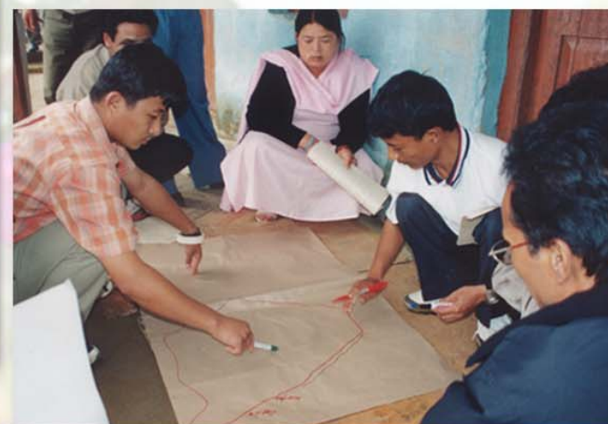
3 Corridor management plans drafted Participatory corridor planning