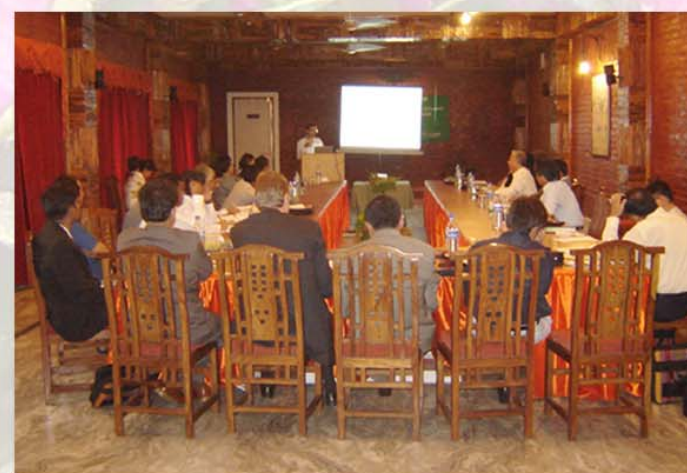
7 Policy framework for regional cooperation drafted Regional policy workshop in Sikkim