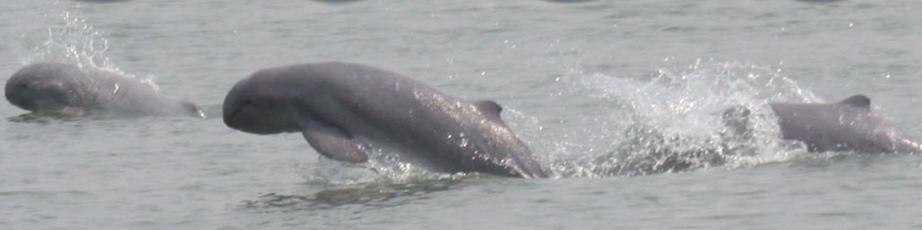
Willingness to Pay for Dolphin Ecotours